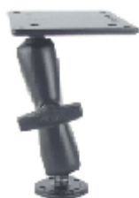
Table or wall mountable Mount for unit up to 4.5kg VESA 75 & 100 2.5" diameter base Arm length 5.625"